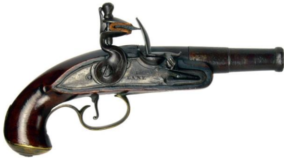
Figures 12a & b - A pistol by Thomas Lane, c1760