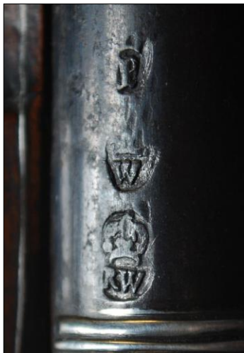
Figure 1 a & b – A sporting gun by Richard Wilding of Shrewsbury, c1715, the barrel stamped with the letter P within an oval together with a crowned W and crowned RW (Dudmaston House: DUD/M/20 - National Trust)