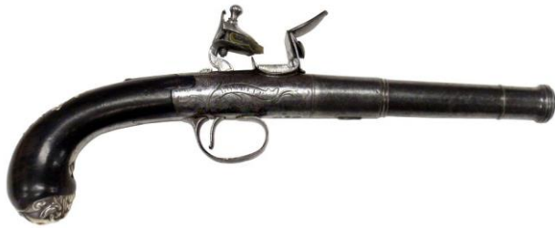
Figure 9 – A pistol by S. Bowdler, c1750, the barrel stamped P & V within ovals and makers mark SB