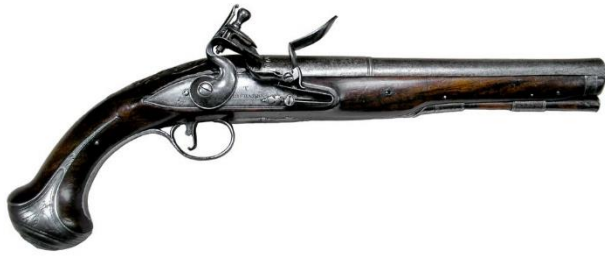
Figures 11a & b - A holster pistol by Thomas Richards, c1760, the barrel with a crowned P struck twice, and the makers mark TR