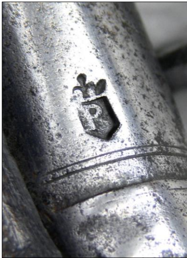
Figure 2a & b - A holster pistol by Joseph Farmer of Birmingham, c1715-20, the barrel stamped with the letter P within a shield