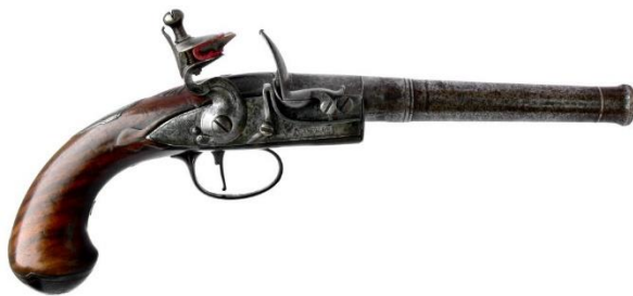
Figures 5a & b - A rifled turn-off pistol, c1740, by William Hawkes, Oxford (active c1730- c1756).