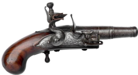
Figures 3a & b - A pocket pistol by R. Farmer, c1715 the barrel stamped with the letter P within an oval