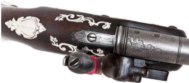
Figure 4 - A pistol by J.Pendril, c1730, the barrel stamped P & V within ovals

As the 18th century progressed, private proof marks became more common. The usual marks are a crowned P and V contained within an oval (occasionally without the crown). Their similarity to the proof marks of the London Gunmakers Company suggests that this was an attempt to demonstrate that their barrels were properly constructed and proof tested and thus just as good as the London product. The London gunmakers objected most strongly to this practice and confiscated any examples found in the city and its environs as well as fining the people concerned. In 1717, the Gunmakers Company offered a 5 guinea reward in the London Gazette for information concerning the use of "false or counterfeit stamps in imitation of ye sd company's mark" ("Dictionary of London Gunmakers 1350-1850", H.L.Blackmore 1985, p.22).