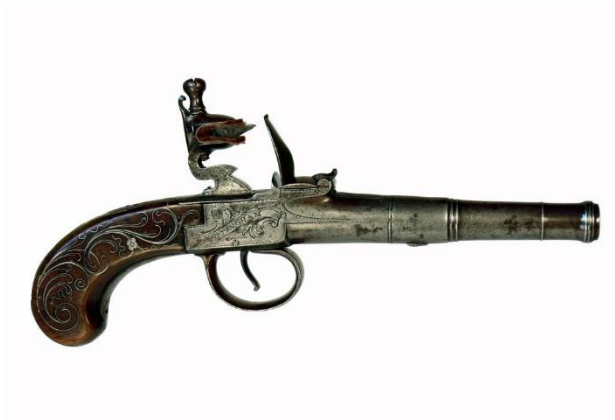
Figures 7a & b - A pocket pistol by Samuel Newton, Nottingham, c1750