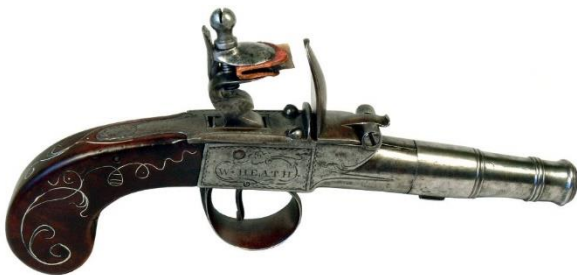
Figures 10a & b – A pocket pistol by W. Heath, c1740-50, the barrel stamped with crowned P & V within ovals and makers mark EI

The crowned P & V proof marks are generally referred to by collectors and dealers today as "Birmingham private proofs"; this is almost certainly due to the fact that many known Birmingham pieces are found with these marks. Some provincial makers used very similar marks, suggesting that they might either have sent their own barrels to Birmingham for proof or else bought Birmingham made barrels. This became more common after about 1760 and certainly by 1800 all manner of firearms could be ordered from a Birmingham gunmaker, complete with whatever signature was required. Examples of these early marks and the Birmingham makers on whose firearms they appear are shown in Figures 10 – 15 below.