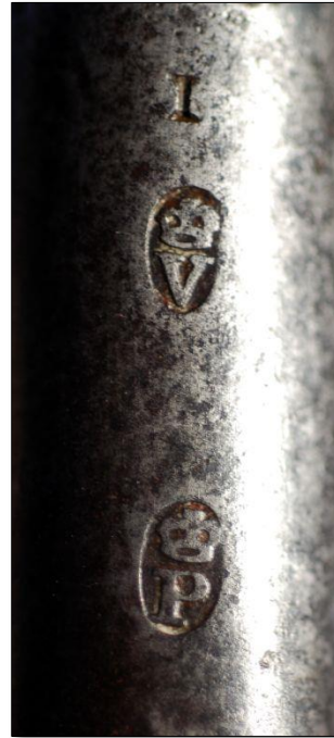
Figures 15 - From a pistol by I. Pratt, c1770, the barrel stamped with crowned P & V within ovals and makers mark TK