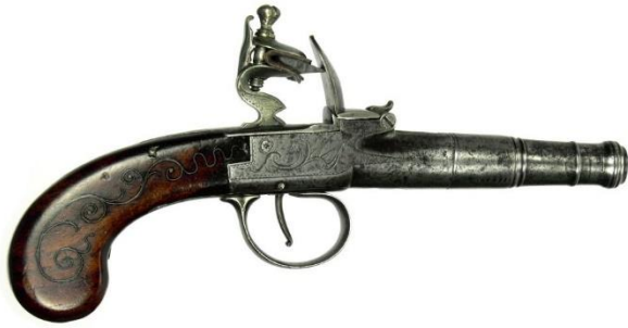
Figures 6a & b - A pocket pistol by J. Warren, c1740-50