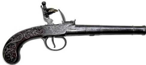
Figures 16a & b - A pistol by Turvey of London, c1775, the barrel stamped with crowned P & V within ovals and barrel makers mark TC under a crown

Figures 16 - 22 below show some of the many variations of markings that have been found for period 1750 - 1820.