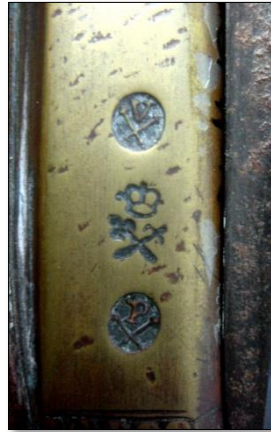
Figure 22 – From a blunderbuss by Wise of Bristol, c1780 (Clevedon Court: National Trust CLE/A/2)