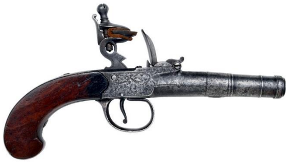
Figures 14a & b - A pocket pistol by Ketland & Co, c1780